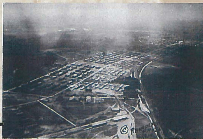
Aerial Photo of the Camp Dodge Station area looking south—1919

Over 125,000 soldiers trained at Camp Dodge, arriving from more than 12 states.