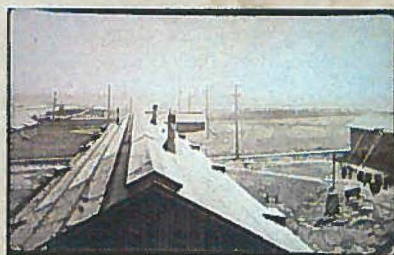
One of the Barracks located at the Remount Station located west of Beaver Creek