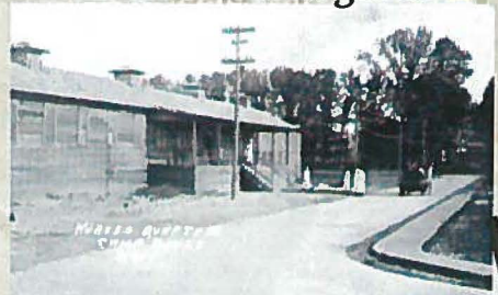
This peaceful scene of the hospital area changed during the deadly flu epidemic of 1918—over 700 soldiers died at Camp Dodge.; over 6,000 fell ill.