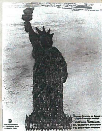
The living Statue of Liberty Photo consisting of 18,000 soldiers was most likely taken at this parade ground.