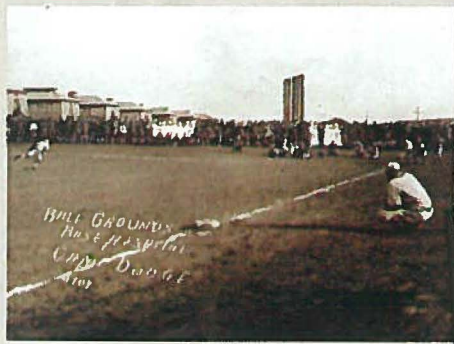
The Base Hospital, located north of the town of Herold was also the site of baseball games.