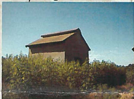
World War I Ammunition Building, still in existence.