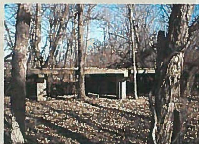
The Remount Station also housed the Camp's incinerator. The loading dock still exists today.