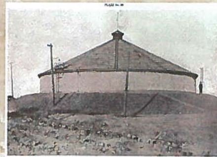
WWI Camp Dodge's Water Tower still stands, minus the peaked roof.