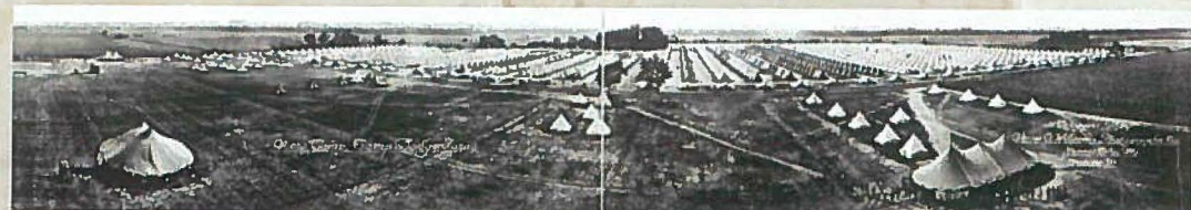
Camp Dodge's Tent City looking west toward Beaver Creek.

During World War I, Camp Dodge was selected as the 13th Cantonment. Up to 3,000 buildings were constructed in a few short months, with most dismantled in the 1920s.