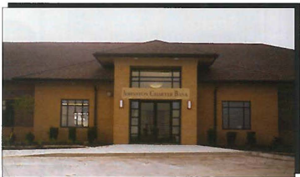
Chart Your Success With Us!

You'll find friendly and experienced local decision makers who have interest in your account at Johnston Charter Bank, where we invite you to